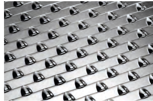
CONIDUR® – the perforated plate from HEIN, LEHMANN